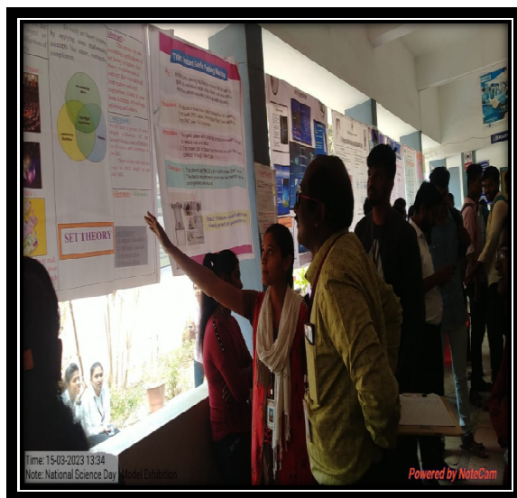
Presentation of poster on "Set Theory" by B.Sc.II students