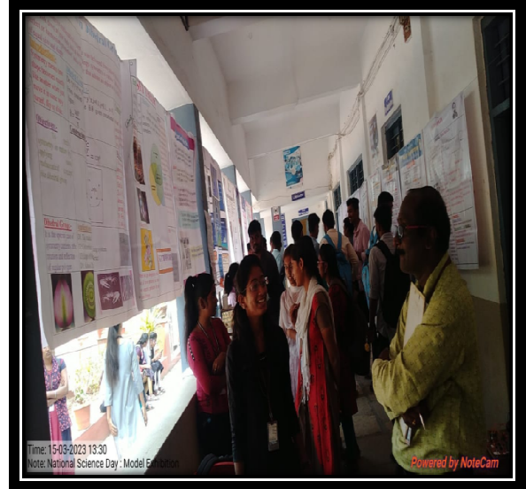
B.Sc.III students presenting poster on "Natural Symmetries in Dihedral Group"