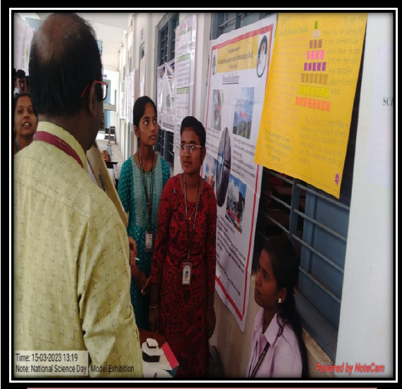
B.Sc.I Students presenting poster on "Pascal Triangle"